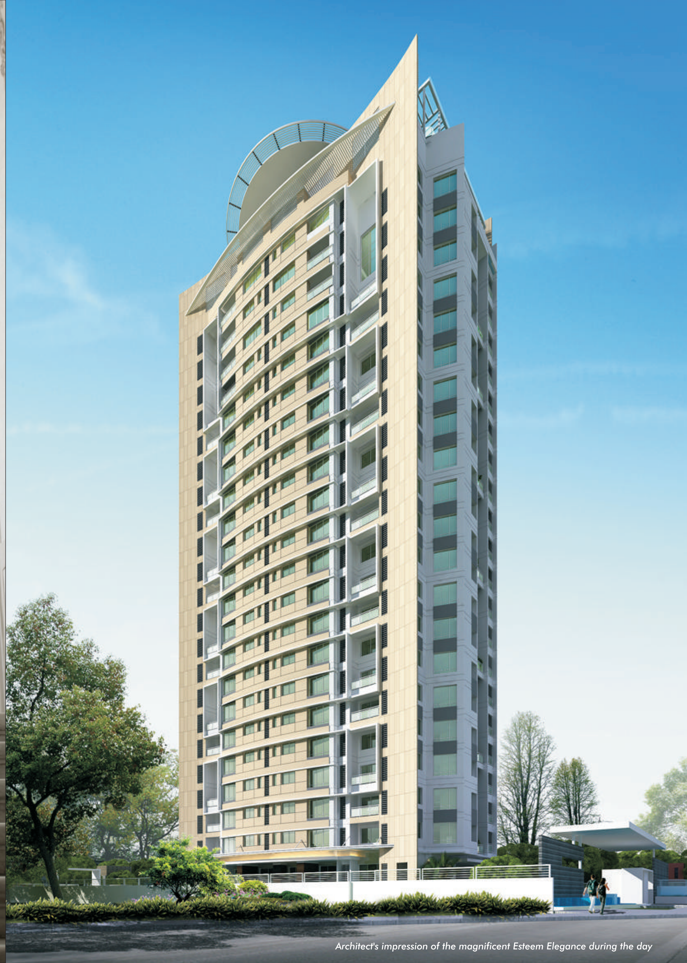
Architect's impression of the magnificent Esteem Elegance during the day

We invite you to an exclusive preview of what we have in store for the true connoisseurs of luxury